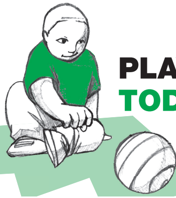
Illustration by Billy Nuñez, age 16